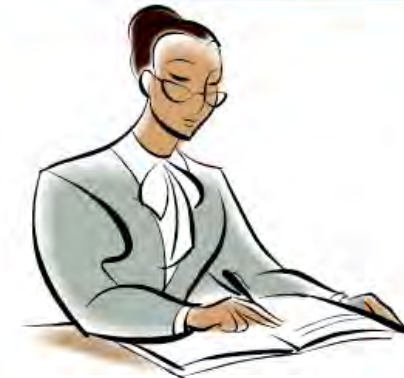
Program Director/ Principal Investigator

PD/PI identifies Trainee, initiates Appointment by filling out the 2271 and routes 2271 to Trainee